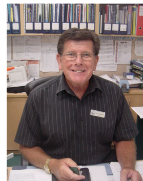
From the Principal's Desk