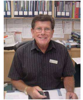
From the Principal's Desk

If you would like to help your students with mathematics, the following website provides information and activities for parents and families to help support children's learning— www.nzmaths.co.nz/node/453