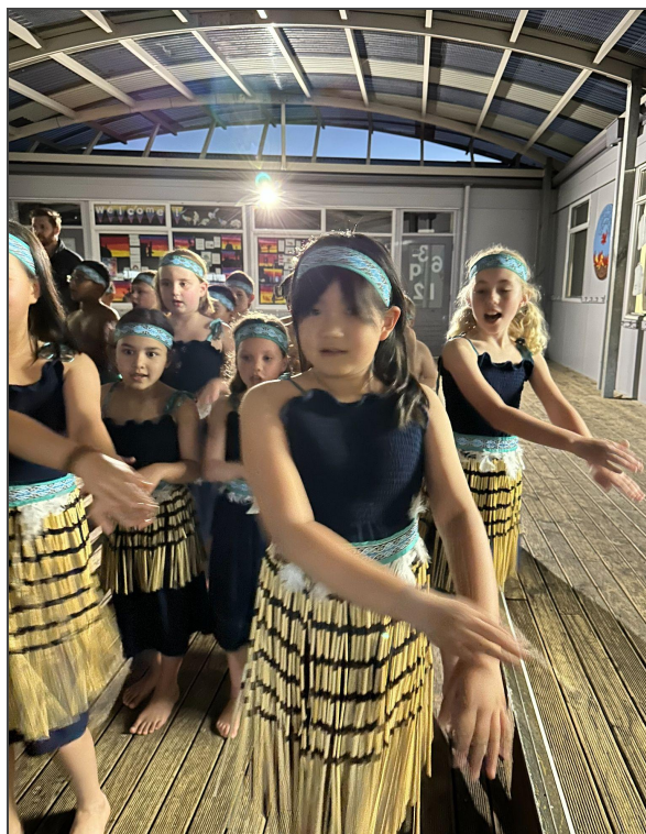
Māori Cultural Dance - 传统毛利文化舞蹈

Induction into school. Guided tour and welcome from school management. (Students arriving on the first day of term also receive a ceremonial Māori welcome). English Language lesson in our ESOL department. Introduction to host classroom and designated school buddy. Commence in-class learning programmes.