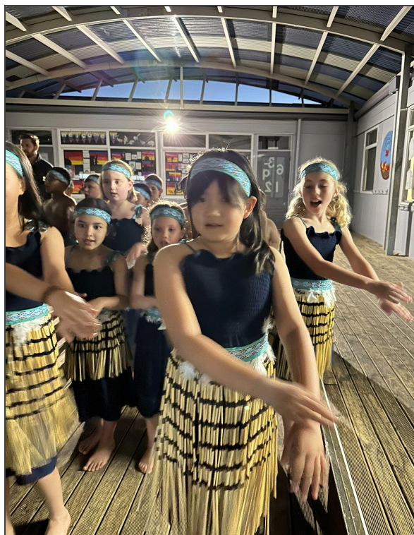
Māori Cultural Dance - 传统毛利文化舞蹈

Induction into school. Guided tour and welcome from school management. (Students arriving on the first day of term also receive a ceremonial Māori welcome). English Language lesson in our ESOL department. Introduction to host classroom and designated school buddy. Commence in-class learning programmes.