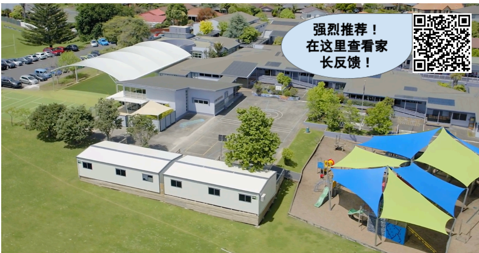
Our campus - 我们的校园